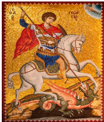
ST GEORGE'S DAY TUESDAY 23RD APRIL

First reading Acts 9:26-31 Responsorial Psalm Psalm 21:26-28, 30-32 You, Lord, are my praise in the great assembly. Second reading 1 John 3:18-24 Gospel John 15:1-8